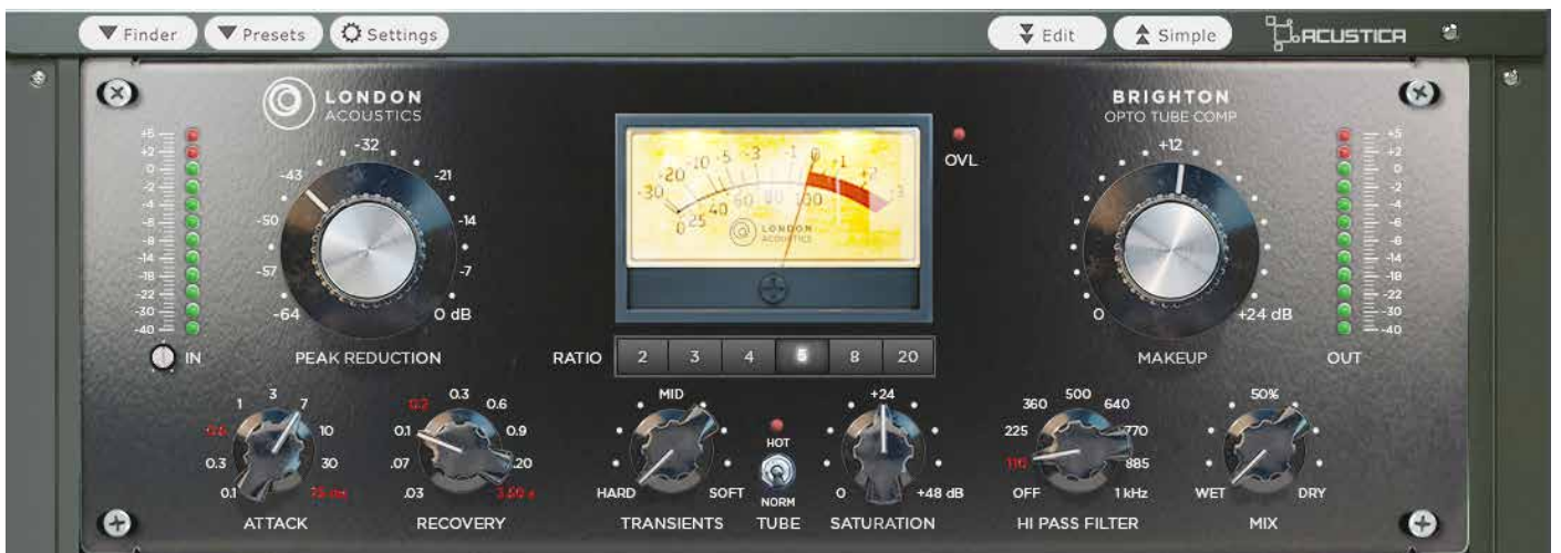
AR Acoustic Guitar In Front Of The Mix - gold for “voice & guitar only” songs.