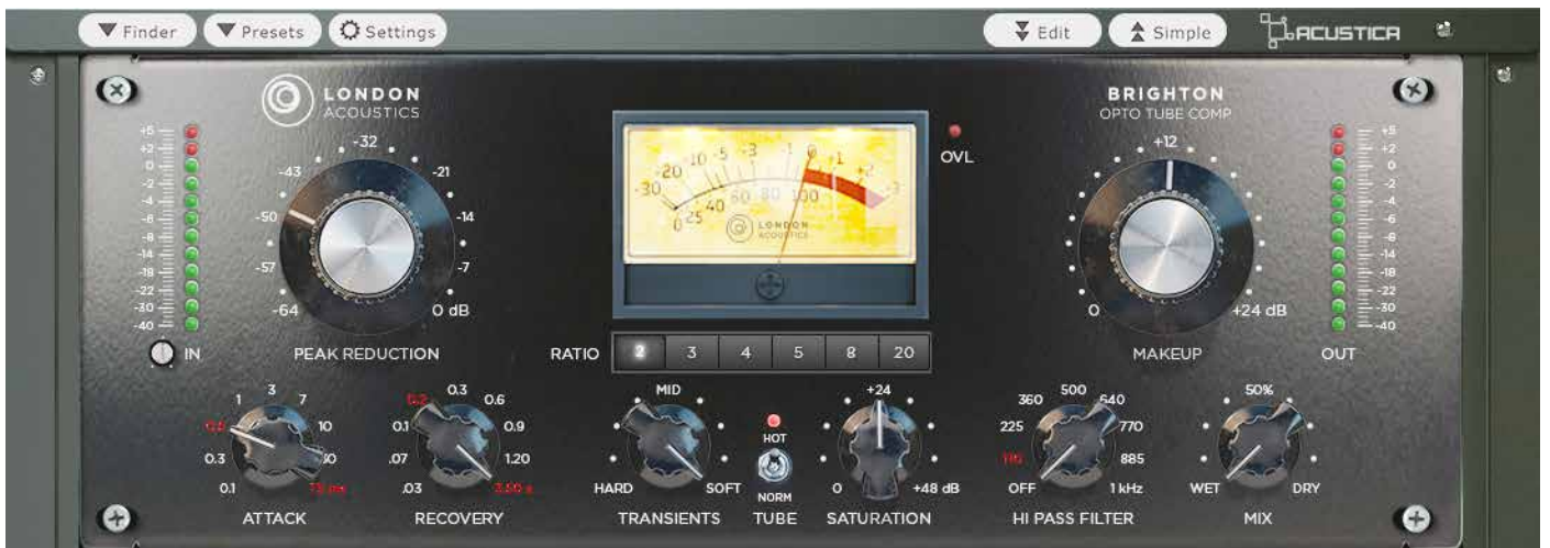
Bass Auf! - a classic LA-2A bass style in your mix.