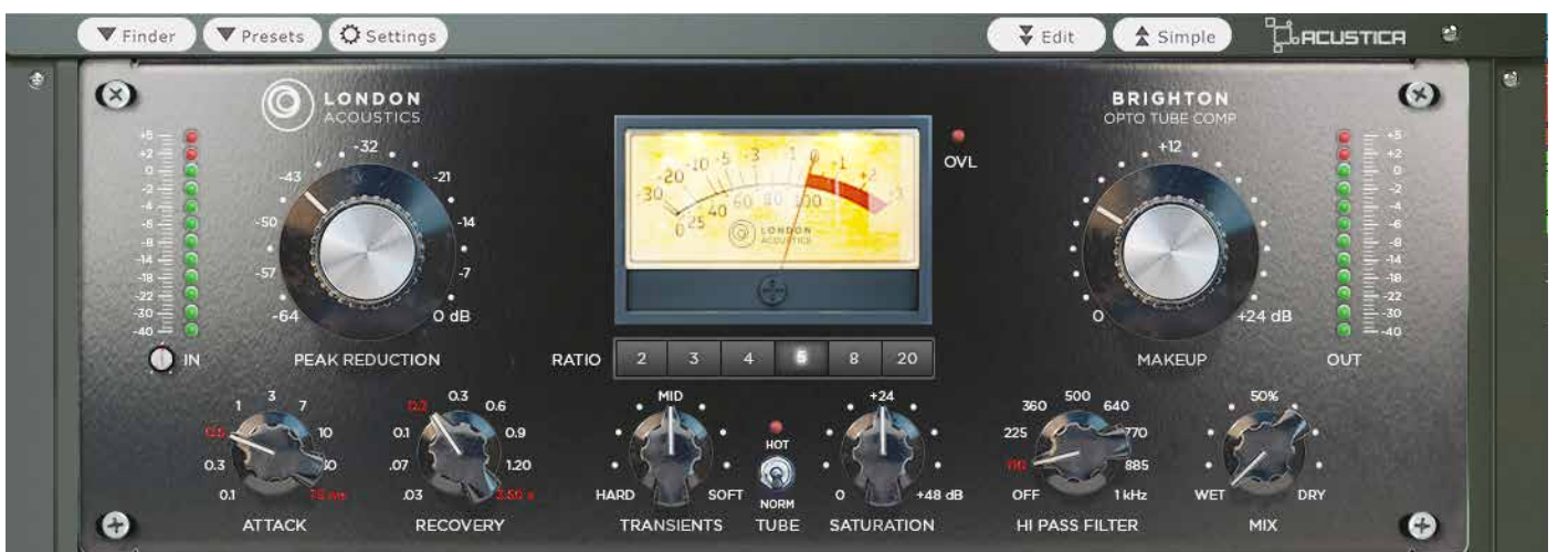
Voice Under Control - no more volume rollercoaster.