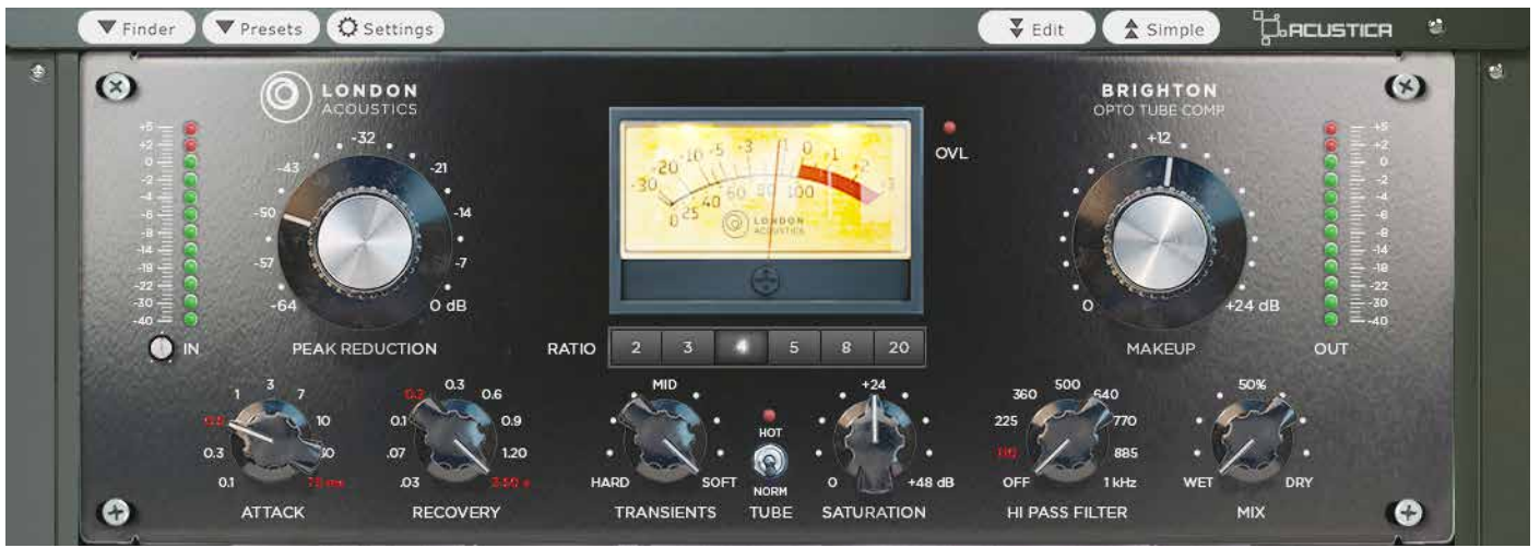
Acoustic Guitar Set In The Mix - “hay, folk!”