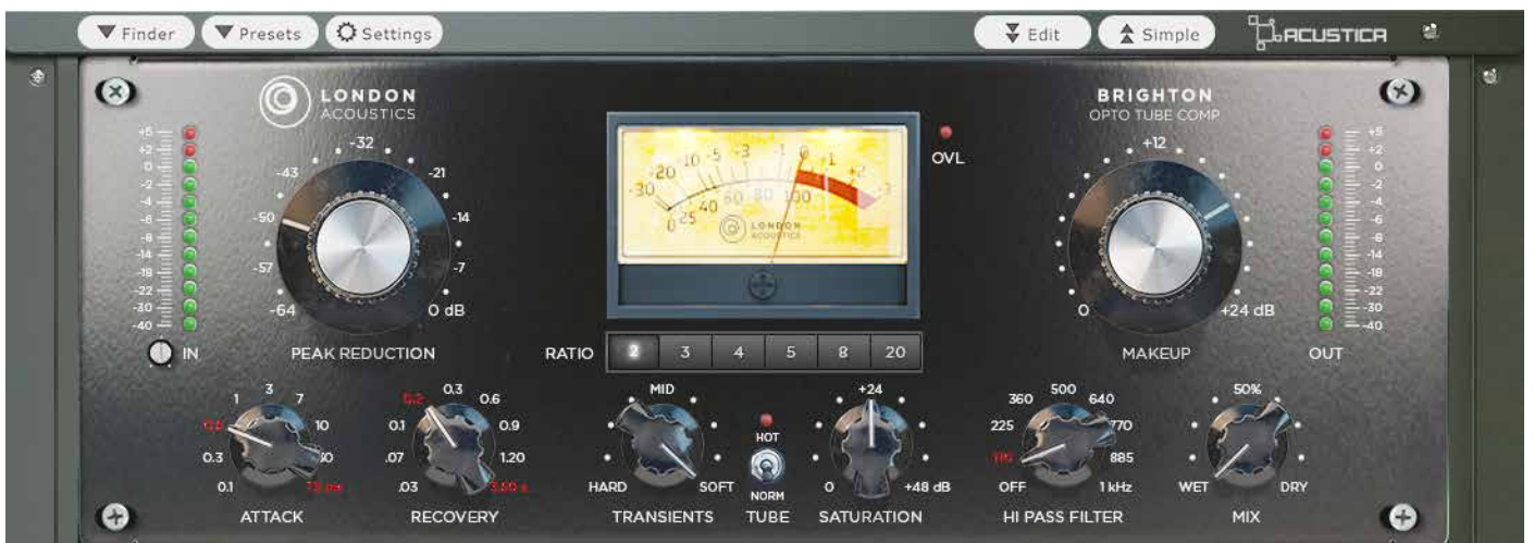
Analog Synth Track - try also the TUBE button option.